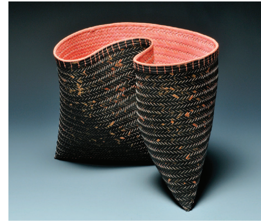
Dorothy McGuinness , Conjoined , watercolor paper, acrylic paint

Dindy Reich , Icon with Cradled Pearl , sterling silver, carnelian, actinoceras, brass