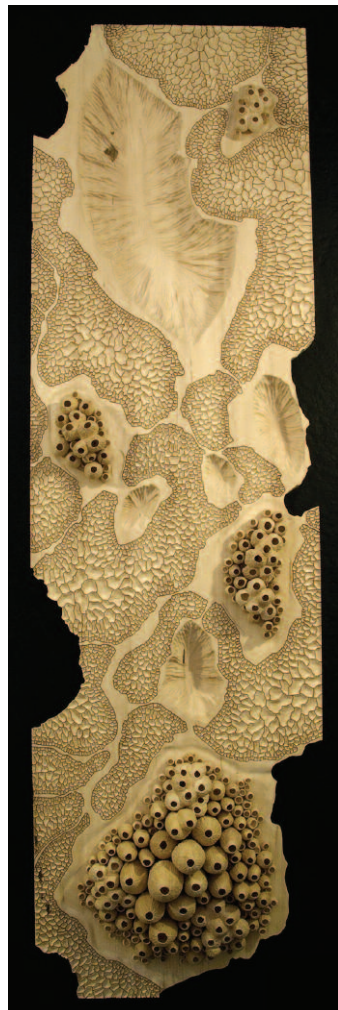
Evan Lightner , Chest on Stand Five , ebony composite veneer, antique reclaimed piano ivory, holly, soft maple